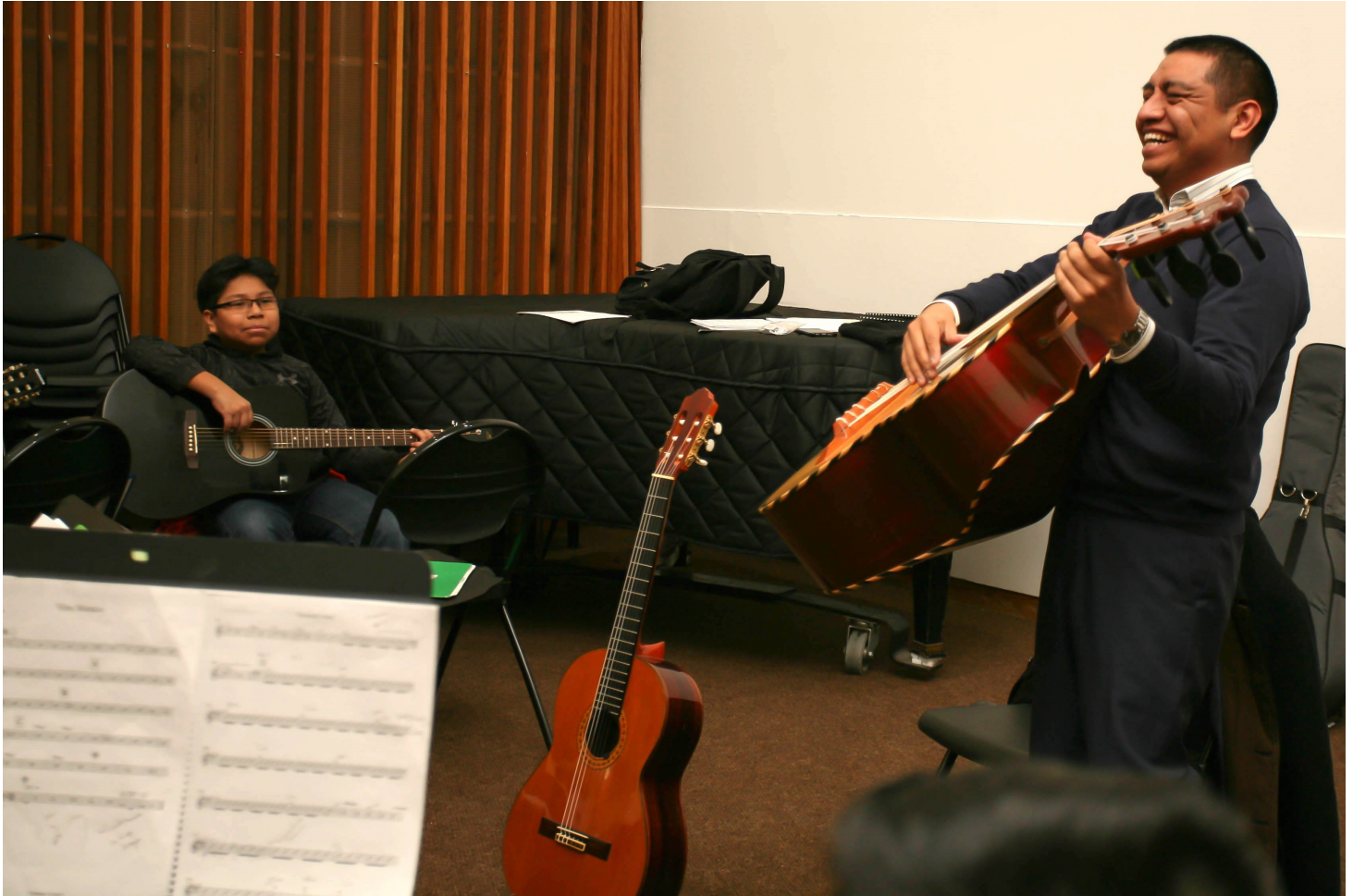
Students learn guitar at the Mariachi Academy of New York.

communities, sharing traditions, mentoring the next generation, and performing in community settings. When they are not touring internationally or performing at premier venues like Lincoln Center, immigrant artists and groups like the New York Crimean Tatar Ensemble of Borough Park and the Queens-based Mariachi Real de Mexico lead arts and cultural organizations dedicated to supporting and serving immigrant artists and audiences.