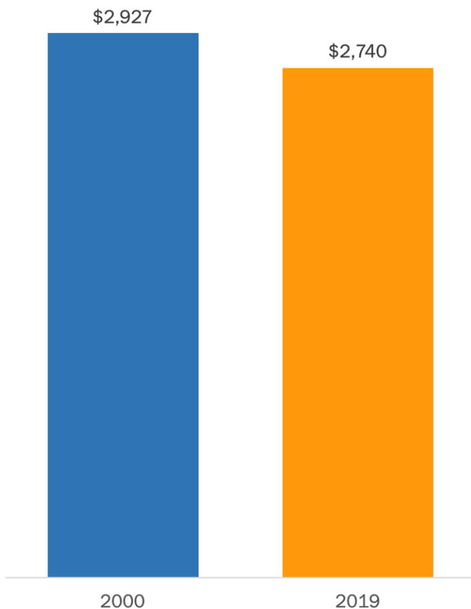
Per-Student Baseline State Funding for CUNY Community Colleges Has Stagnated

Source: CUF analysis of enacted state budget appropriations for CUNY Community College operations, FY2000 and FY2020, adjusted for inflation