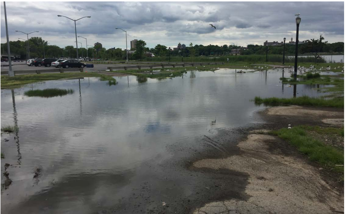
A parking lot in Flushing Meadows Corona Park remains flooded two days after a rainstorm.