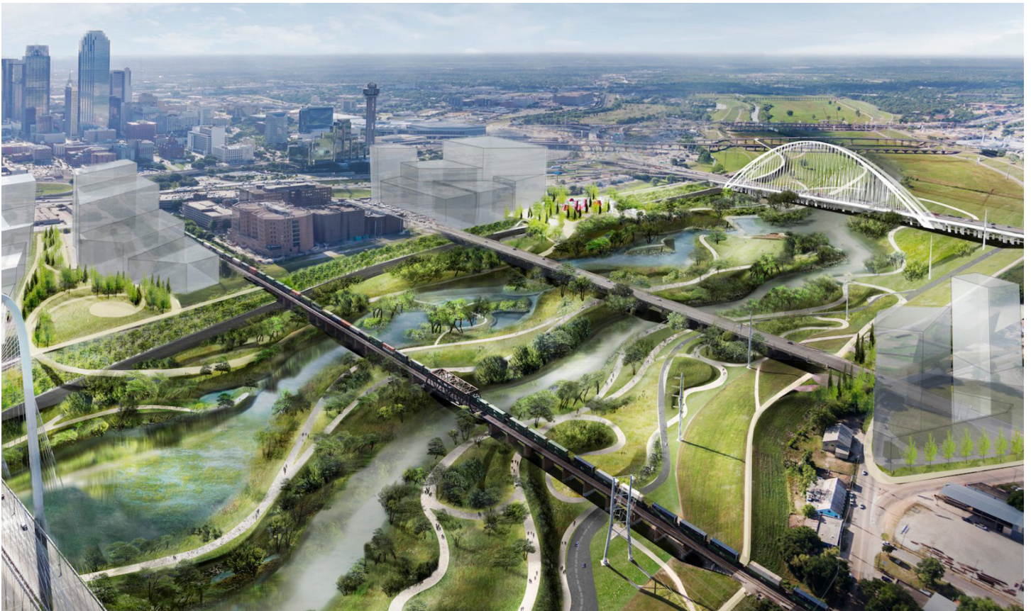
Trinity River Park in Dallas, envisioned as a natural area along a major floodplain, would be the largest urban park in the nation when completed.