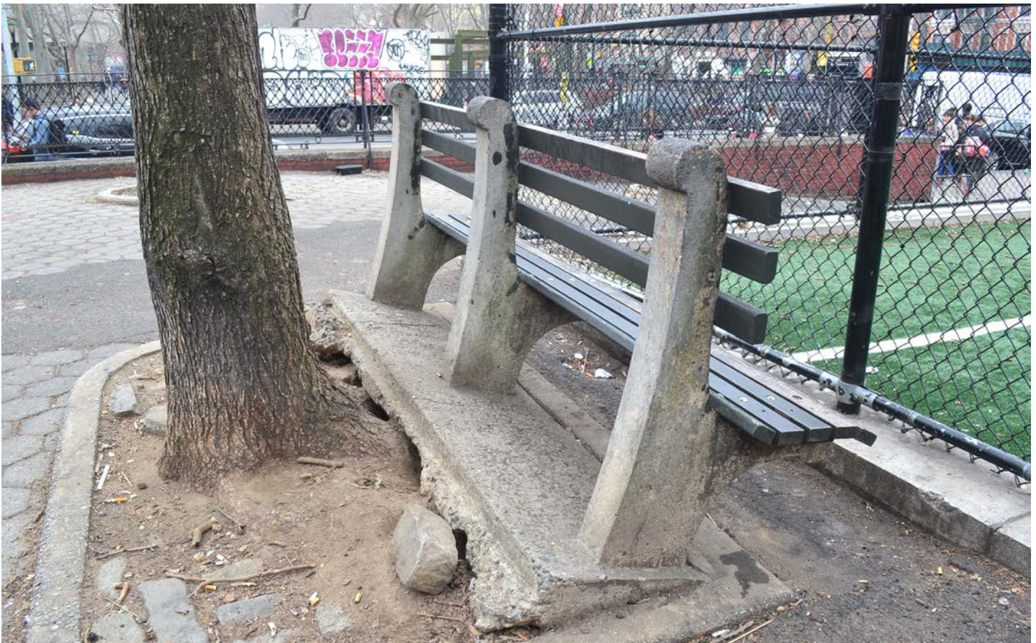
A bench is uprooted in Sara D. Roosevelt Park.

In 65 parks surveyed citywide, 23 comfort stations had serious issues, including broken doors and stalls, unusable amenities, and locked facilities. Several were nearly inaccessible, or closed entirely, because of plumbing issues, and facility structures were noticeably decaying. In Harlem River Park, the comfort station was found to be unusable, with sewage on the floor. In Corona, Queens, the comfort station at Park of the Americas had cracked windows, and several stalls were missing doors. The comfort station at Charybdis Playground, in Astoria Park, has been closed since 2015, when the city discovered that the sewage from the bathroom had been draining directly into the East River for decades. 39 (Its reopening has since been delayed until