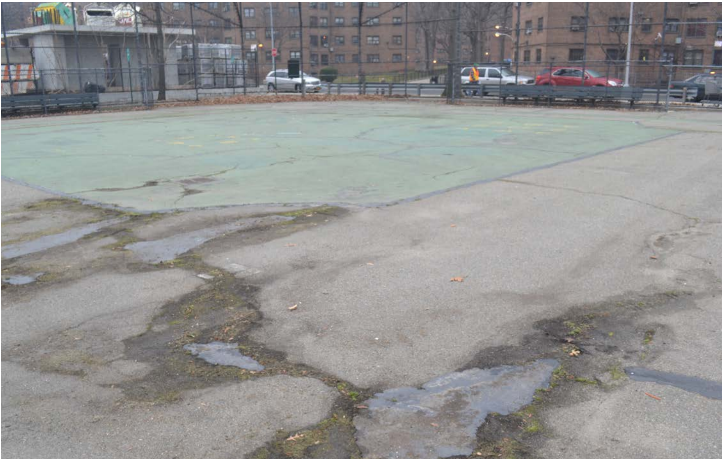
Water damage erodes the play surfaces at Hallet's Cove Park in Astoria.