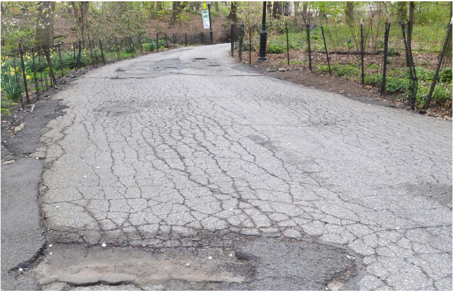
Cracks and potholes spread across the pavement in Riverside Park.

behalf of specific parks and infrastructure needs, resulting in a system in which new facilities and visible improvements are far more likely to receive funding than fixes to invisible infrastructure or preventative maintenance.